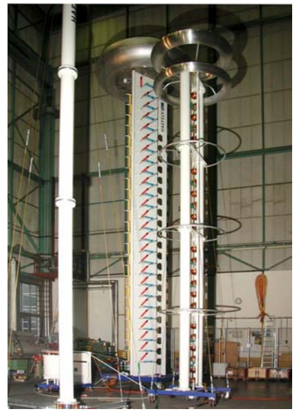
Multiple chopping gap MAFS in front of an SGDA

The H base frame of welded steel profiles is equipped with four swivel castors.