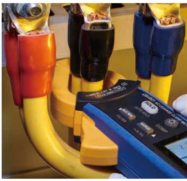
Clamp thick wires and double wires with narrow spacing smoothly