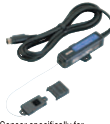
Sensor specifically for blue-violet optical lasers (detachable model)