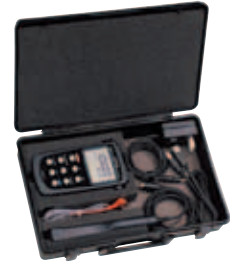
Handy for travel and storage

Optical Power Meters installed with firmware version 1.01 or earlier must be updated to support compatibility with the new Optical Sensor 9743/ 9743-10