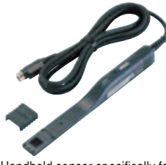
Handheld sensor specifically for blue-violet optical lasers