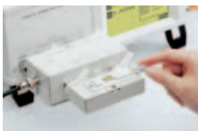
Example of connecting the 9262 and 9268 / 9269

Using the optional 9268/9269 DC BIAS UNIT, voltage and current bias measurements are simple. The 9268 can be used for voltages up to a maximum of DC \pm 40 V. The 9269 can be used for currents up to a maximum of DC \pm 2 A.