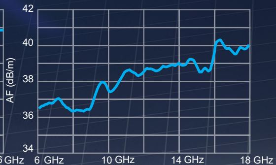
DR-01 - Antenna Factor