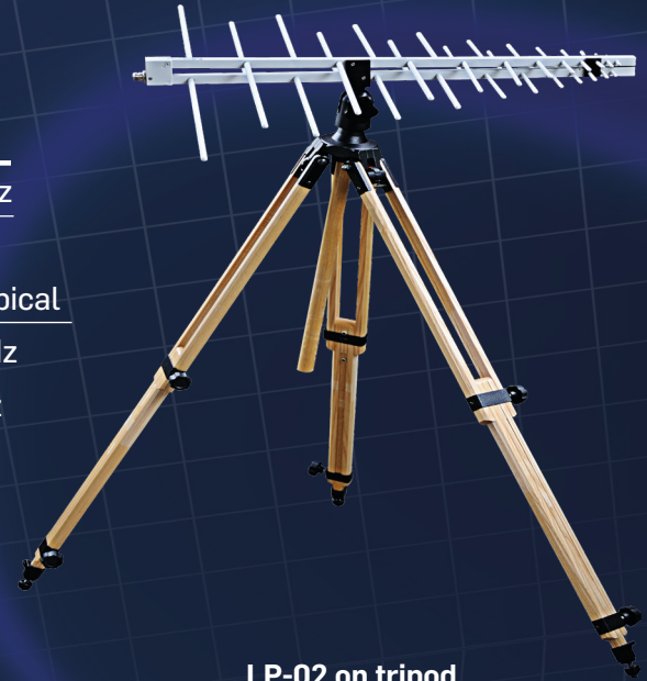
LP-02 on tripod