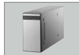
A291510 / A291512