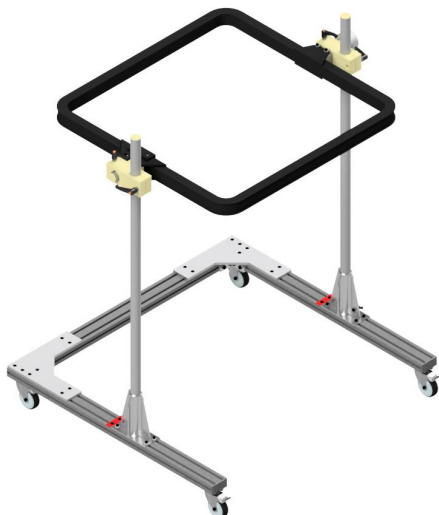
MAG 1000 Antenna with included Stand

The MAG 1000 can be used for both vertical and horizontal plane testing by simply rotating the coil antenna in its mounting on the included stand. The MAG 1000 can be operated in both short duration tests and continuous testing which makes it an ideal stand-alone test system for IEC 61000-4-8 and others.