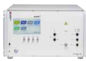
AXOS 8 EFT/Burst Test System Article no. 2490830

Surge 1.2/50µs...8/20µs IEC/EN 61000-4-5