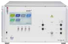
AXOS 8 Ring Wave Test System Article no. 2490820

Surge 1.2/50µs...8/20µs IEC/EN 61000-4-5