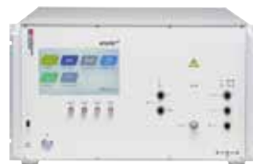
AXOS 8 Surge Test System Article no. 2490810

Surge 1.2/50µs...8/20µs IEC/EN 61000-4-5