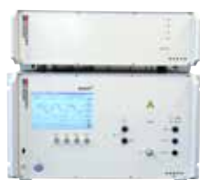
AXOS 8 Dips Test System Article no. 2490840

Surge 1.2/50µs...8/20µs IEC/EN 61000-4-5