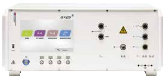
AXOS 5 front view

A wide range of cost-efficient and user friendly coupling / decoupling networks for power lines as well as for symmetrical and asymmetrical data- and signal lines are available as options.