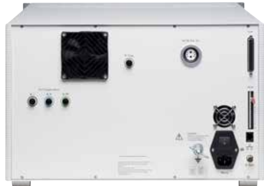
AXOS 8 rear view