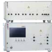
AXOS 8 Telecom Wave System Article no. 2490850

Surge 1.2/50µs...8/20µs IEC/EN 61000-4-5