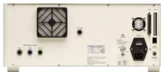
AXOS 5 rear view