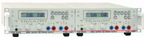
19" adapter, TOE 9522 2 HU, parallel installation set for 2 units of the TOE 8950 series