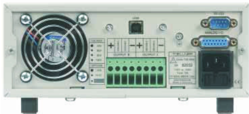
Rear of unit Dual-output power supply with USB interface TOE 8952 series